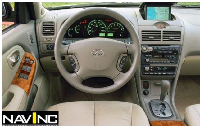
QX56 2004 - 2007