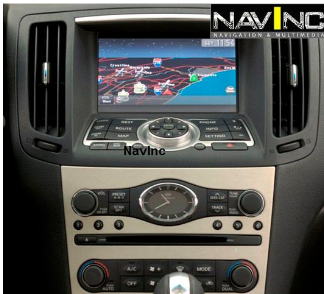
I35 2001 - 2004