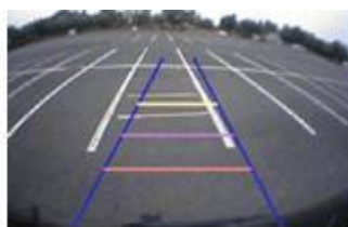
Ajustable guide lines