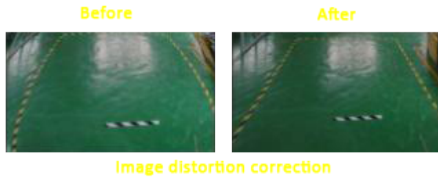
Image distortion correction

The camera runs on intelligent software. As a result the unwanted bulging in the camera image is automatically corrected.