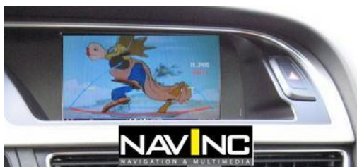
Touch remote buttons

Control of the connected Audio/Video source via touch screen. Remote control buttons will be programmed on the screen via touch screen foil. Via the touch screen foil the connected Audio/Video sources can be controlled without making use of an external remote control.