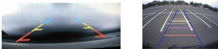
Ajustable guide lines

In the camera image on screen parking guidelines can be displayed. This makes it much easier to determine the distance to the object you are driving towards. The guidelines are adjustable horizontal as well as vertical so the lines can be adjusted to the car.