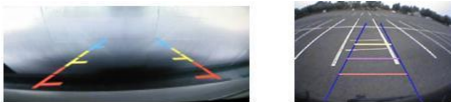
Ajustable guide lines

In the camera image on screen parking guidelines can be displayed. This makes it much easier to determine the distance to the object you are driving towards. The guidelines are adjustable horizontal as well as vertical so the lines can be adjusted to the car.