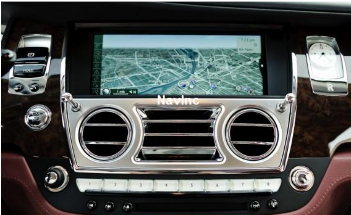
iDrive CIC2 Phantom