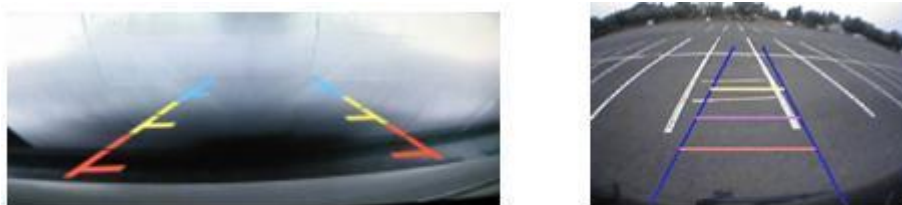
Ajustable guide lines

In the camera image on screen parking guidelines can be displayed. This makes it much easier to determine the distance to the object you are driving towards. The guidelines are adjustable horizontal as well as vertical so the lines can be adjusted to the car.