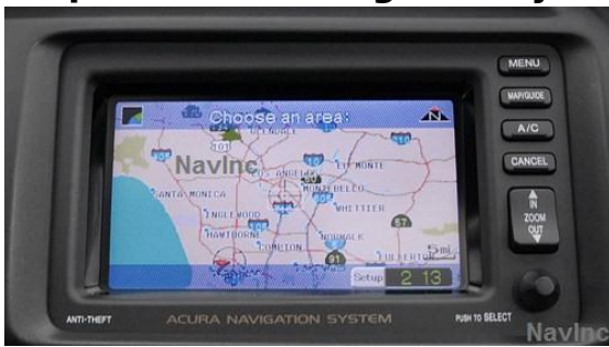
Image of suitable navigation systems: 12-pins Acura navigation system