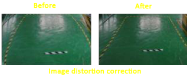
Image distortion correction

The camera runs on intelligent software. As a result the unwanted bulging in the camera image is automatically corrected.