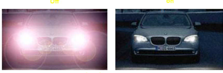
Back Light Compensatior

The camera runs on intelligent software. As a result the appearance of a bright background or lamps in the camera image is automatically corrected.