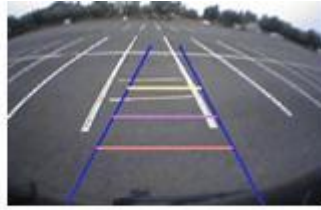
Ajustable guide lines