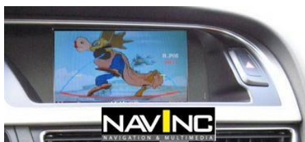
Touch remote buttons

Control of the connected Audio/Video source via touch screen. Remote control buttons will be programmed on the screen via touch screen foil. Via the touch screen foil the connected Audio/Video sources can be controlled without making use of an external remote control.