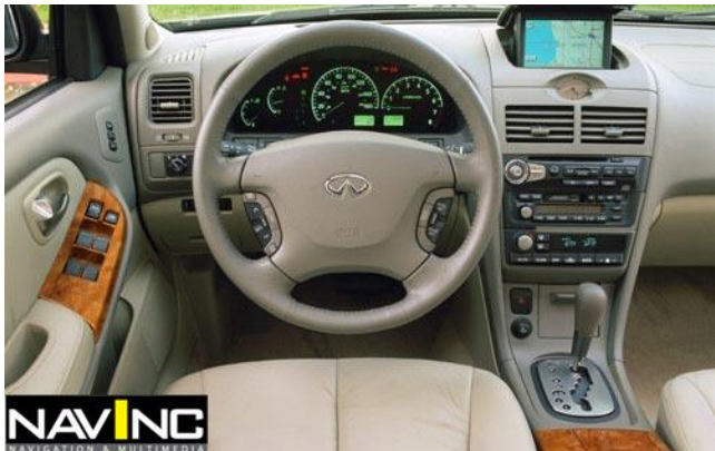
QX56 2004 - 2007