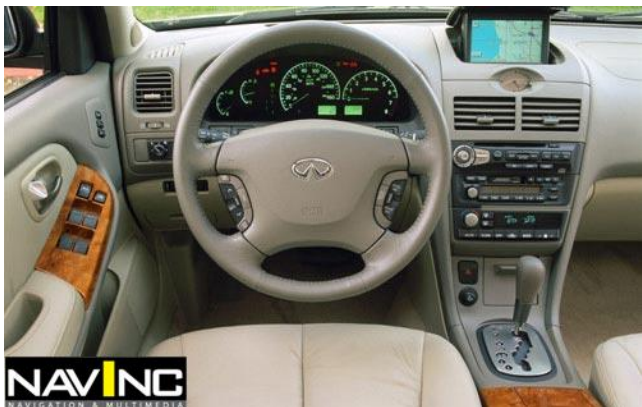
QX56 2004 - 2007