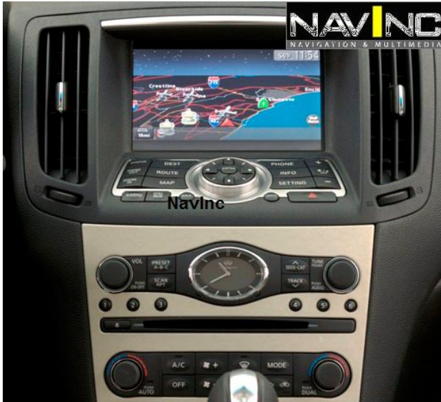
I35 2001 - 2004