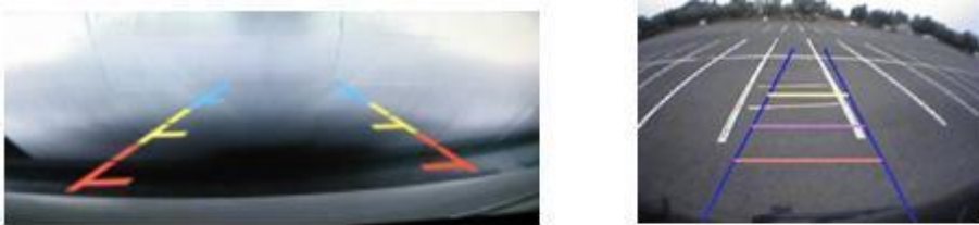
Ajustable guide lines

In the camera image on screen parking guidelines can be displayed. This makes it much easier to determine the distance to the object you are driving towards. The guidelines are adjustable horizontal as well as vertical so the lines can be adjusted to the car.