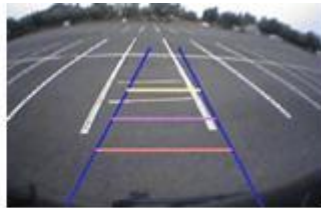
Ajustable guide lines