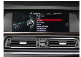
BMW iDRIVE NBT EVO ID5 &amp; ID6