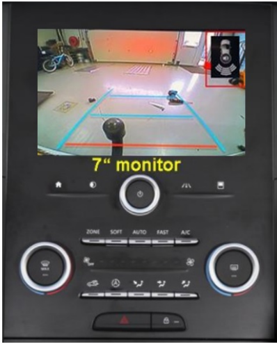
Rlink2 - 7.0"