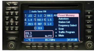
PCM 2.0 - BE6654