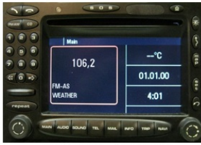
PCM 2.0 - BE6632