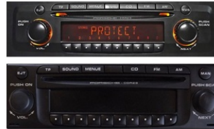
CDR23 - all versions