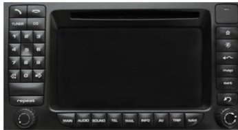
PCM2.1 - BE6693