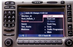
PCM 2.1 - BE6692