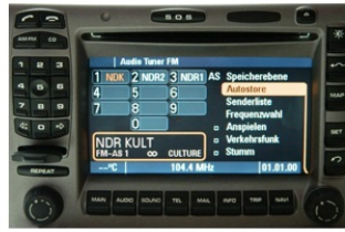
PCM 2.0 - BE6642